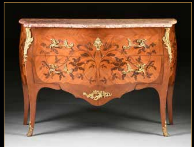
127 A LOUIS XV STYLE MARBLE TOPPED AND GILT BRONZE MOUNTED BOIS DE BOUT MARQUETRY BOMBÉ COMMODE, LATE 19TH/EARLY 20TH CENTURY. Estimate: $1,200 - $1,500

September 21st & 22nd, 1:00 p.m. 6116 Skyline Drive • Houston, TX 2019