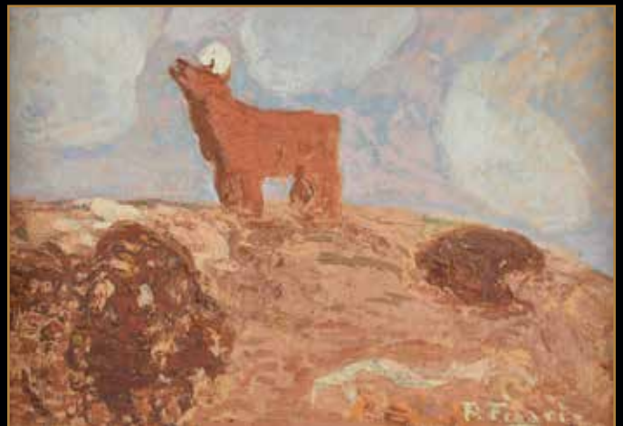
522 PEDRO FIGARI (Uruguayan 1861-1938) A PAINTING, "El Rugido," oil on artist board, signed L/R. 12 1/2" x 18 1/2" Estimate: $3,000 - $5,000