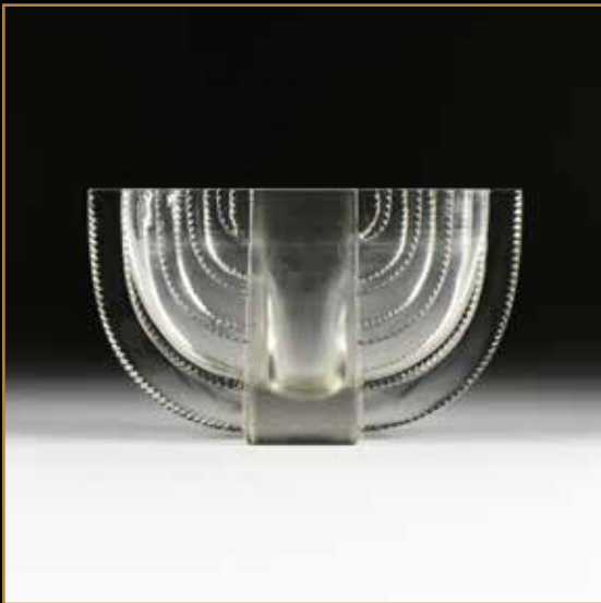
531 RENE LALIQUE (FRENCH 1860-1945) A VILLARD FROSTED AND CLEAR MOLDED VASE, MODEL 10-896, SIGNED, CIRCA 1936. Estimate: $2,000 - $4,000