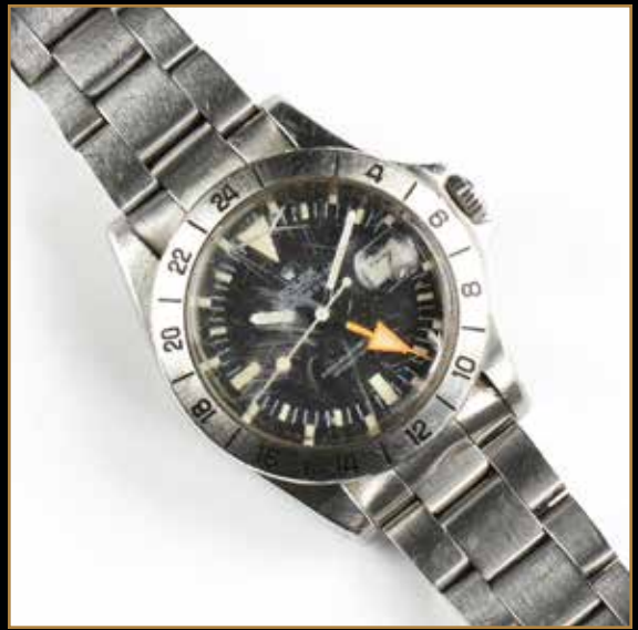
504 A STAINLESS STEEL ROLEX REF. 1655 "STEVE MCQUEEN" OYSTER PERPETUAL DATE WRISTWATCH, CIRCA 1972. Estimate: $10,000 - $15,000