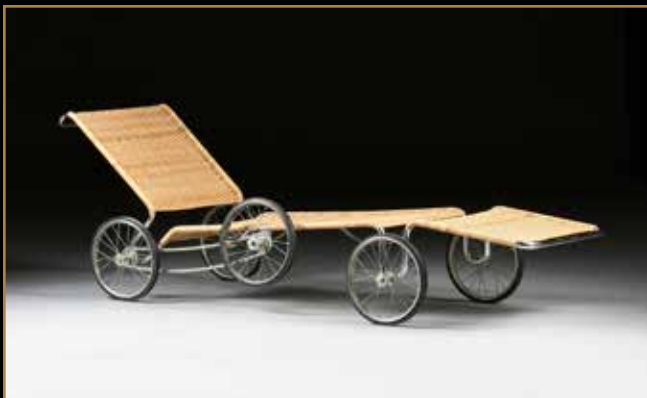
116 A VINTAGE BAUHAUS CHAISE LOUNGE, "F41 Couch on Wheels," after MARCEL BREUER (1902-1981), GERMAN, CIRCA 1984. Estimate: $1,000 - $1,500