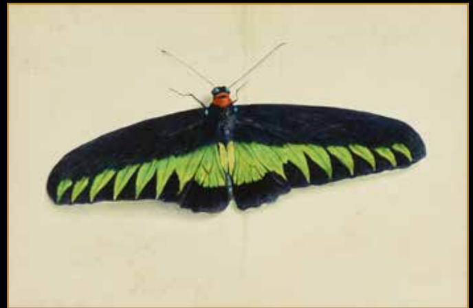
494 KERMIT OLIVER (American/Texas b. 1943) A PAINTING, "The Rajah Brooke Birdwing," signed L/R "Oliver." Estimate: $4,000 - $6,000