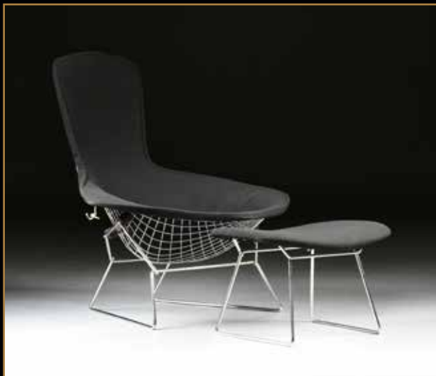
281 HARRY BERTOIA (ITALIAN/AMERICAN 1915-1978) A CHROMED WIRE CHAIR AND OTTOMAN, "BIRD LOUNGE CHAIR." Estimate: $400 - $600