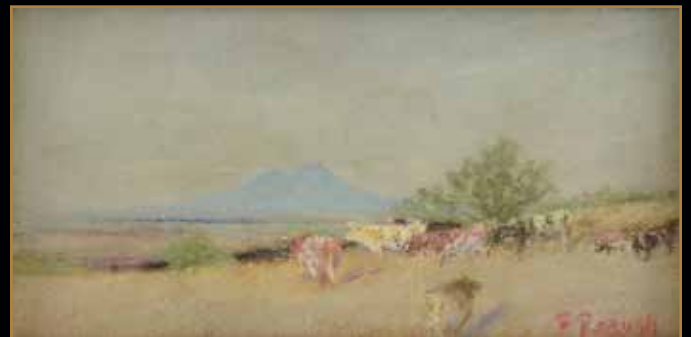
A LOUIS XV STYLE ORMOLU MOUNTED AND BOIS DE BOUT INLAID TULIPWOOD PEDESTAL, LATE 19TH CENTURY. Estimate: $800 - $1,200