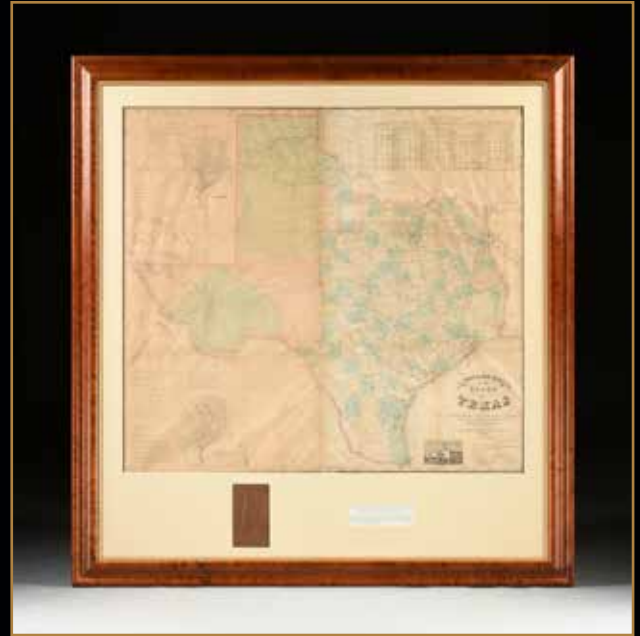
506 A RARE ANTIQUE CIVIL WAR ERA MAP, "Pressler's Map of the State of Texas," THE STRAND, GALVESTON, 1862, hand colored engraving on paper. 46 1/2" x 51" Estimate: $25,000 - $35,000