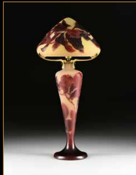
470 A GALLÉ COMEIO GLASS "MAGNOLIA" TABLE LAMP AND SHADE, SIGNED "Gallé," 1910-1920. Height 27 1/2" Estimate: $1,200 - $1,600