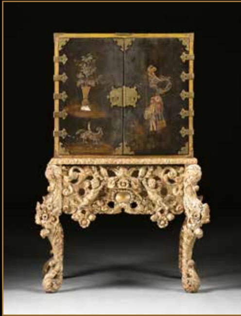
479 AN EDO PERIOD LACQUERED CABINET ON A WILLIAM AND MARY PARCEL GILT AND GESSO STAND, 17TH/18TH CENTURY. Estimate: $2,000 - $4,000