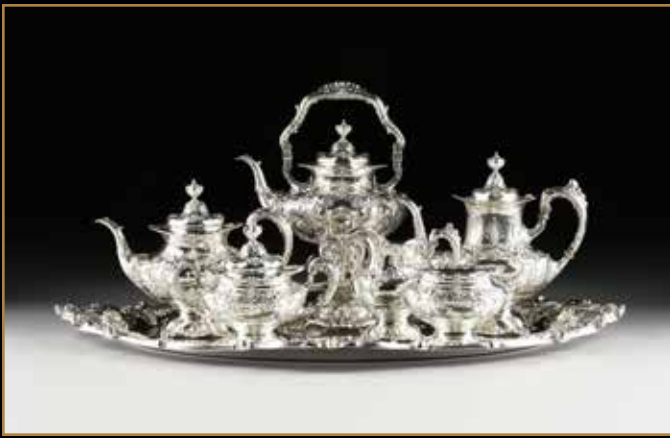
511 A SEVEN PIECE STERLING SILVER REED AND BARTON "FRANCIS I" TEA SERVICE, TAUNTON, MASSACHUSETTS, 1941-1949. Estimate: $25,000 - $35,000